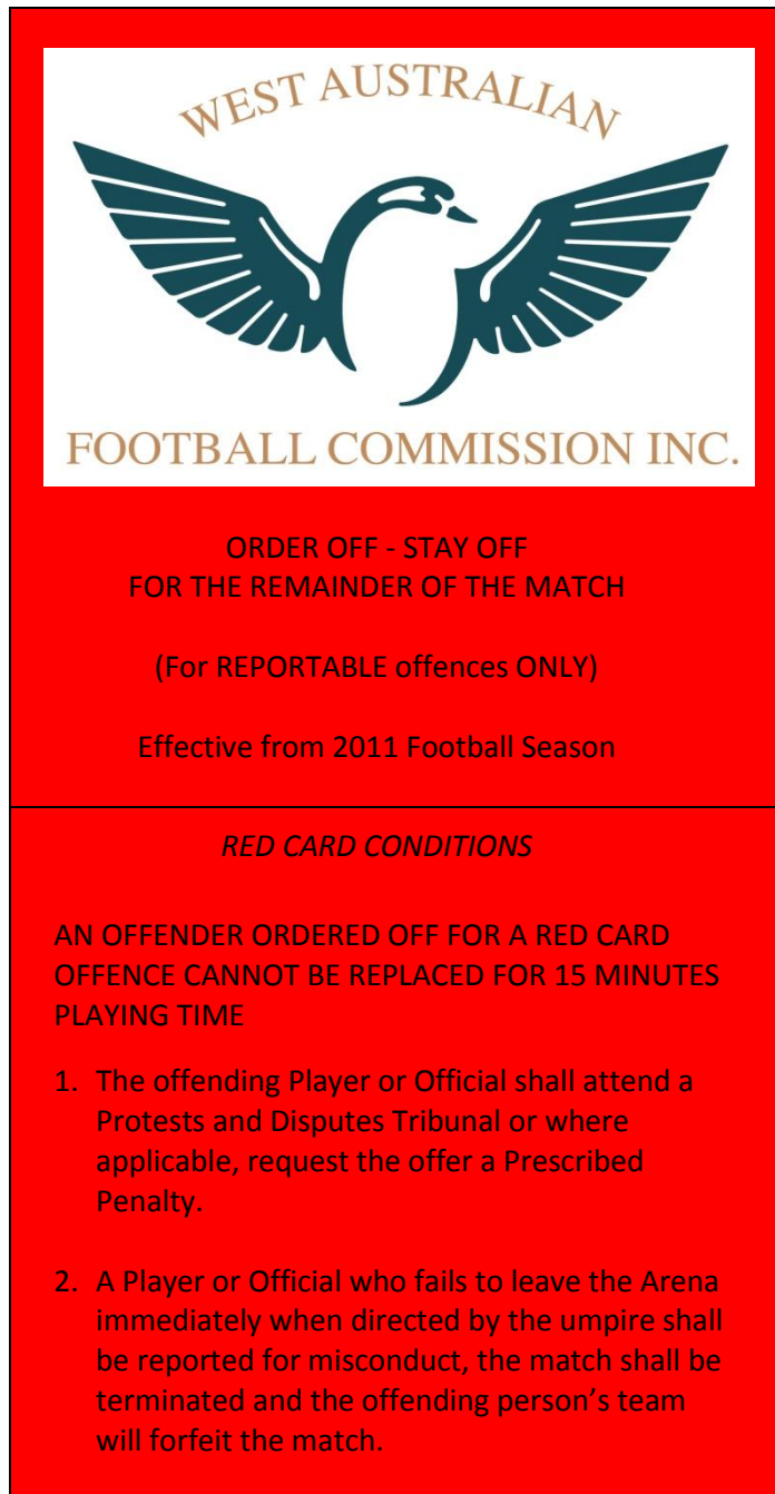
FRONT OF THE RED CARD